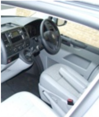
SEAT PACK A Simply a drivers armrest. Add one on passenger side is Seat Pack B Option Seat A ; Seat B Price