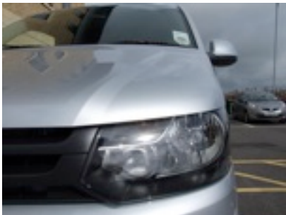
REVERSING SENSORS Makes a beep the closer you get to an object. Doesn't work too well with a towbar Option Reversing sensors