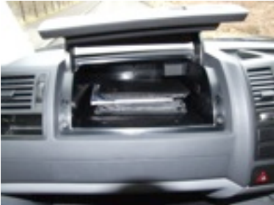
TWIN AIRBAG SAFETY The safest van ever thanks to ABS, EBD, ESP, Twin airbags all as standard

Some popular factory fitted items that might already be on a stock Kombi Sport.